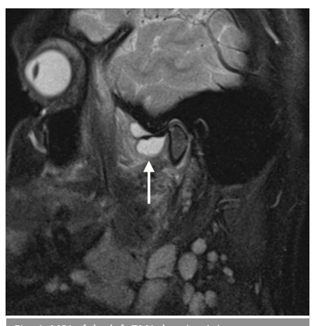
Fig. 1 MRI of the left TMJ showing joint space effusion

The patient was reviewed in clinic, three months following the onset of his symptoms, and reported improvement in symptoms